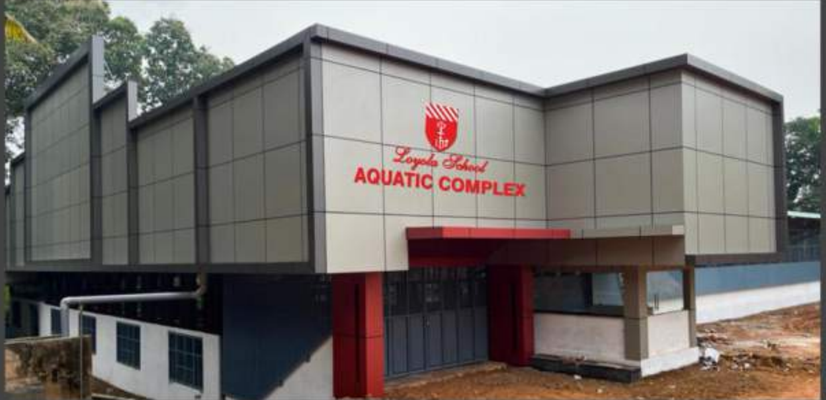
INAUGURATION OF THE AQUATIC COMPLEX AND PARKING SLOT-CUM-PLAY AREA