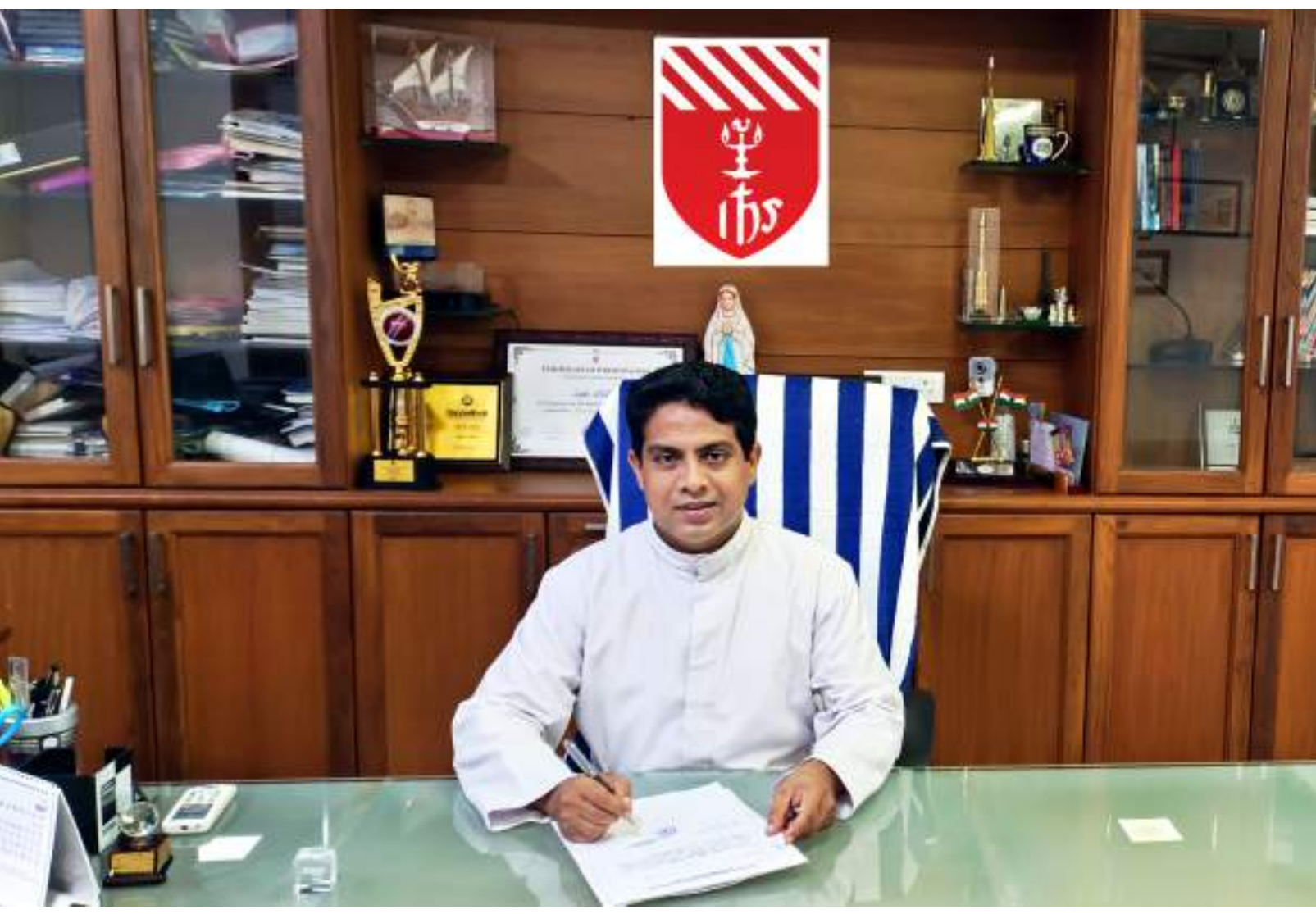
From the Principal's Desk