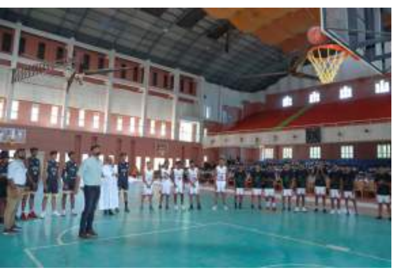
Inaugural shot by the chief guest of the opening day, Shri Umesh Krishna